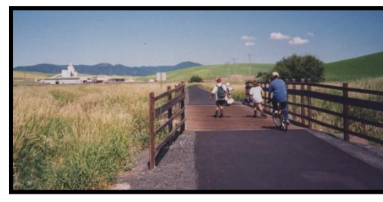
Proposed Regional Bikeway