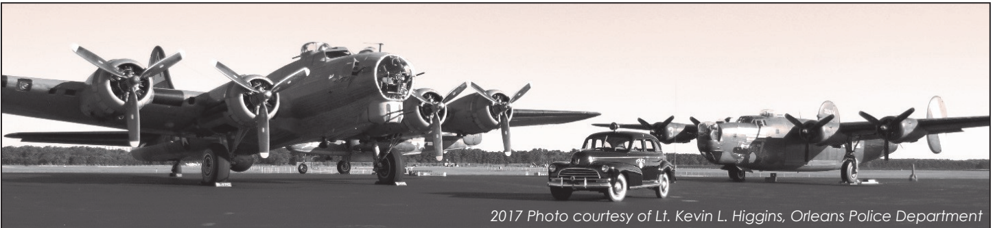
2017