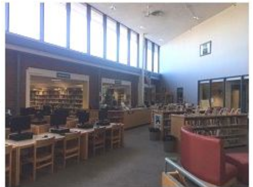
Barnstable High School Library

The HVAC units that service the Barnstable High School Library and adjacent spaces are at the end of life, undersized, inefficient, and no longer able to provide cooling and are in jeopardy of losing the ability to provide heat. The existing distribution and return systems are not adequately designed or insulated for the 2-story space necessitating a system redesign with replacement of diffusers and the addition of low return air ducts to better circulate and distribute tempered air. The existing aluminum and single glazed curtain walls are over 40 years old and are nearing their life expectancy and do not meet modern standards. The single-pane glass panels block very little UV light and contribute to extreme heat gain in the summer, forcing the rooftop AC units to work harder and create an uncomfortable interior environment. The aluminum frame and glazing systems are also extremely inefficient at providing thermal resistance. In addition to the mechanical and solar improvements to the physical space, interior improvements to the space would include paint, flooring and furnishings.