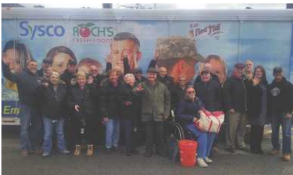
Our thanks to the Massachusetts Military Support Foundation, which delivered Coats4Vets to the BACC.